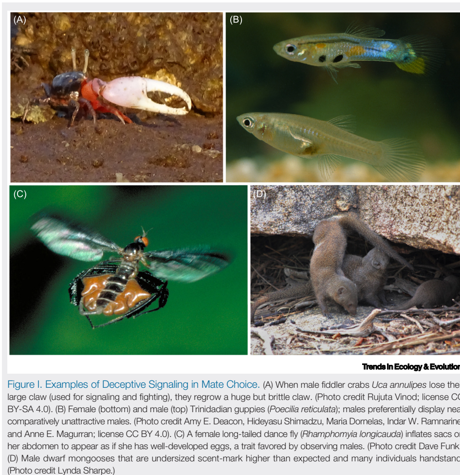
Figure 1. Examples of Deceptive Signaling in Mate Choice. (A) When male fiddler crabs Uca annulipes lose their large claw (used for signaling and fighting), they regrow a huge but brittle claw. (Photo credit Rujuta Vinod; license CC BY-SA 4.0). (B) Female (bottom) and male (top) Trinidadian guppies ( Poecilia reticulata ); males preferentially display near comparatively unattractive males. (Photo credit Amy E. Deacon, Hideyasu Shimadzu, Maria Dornelas, Indar W. Ramnarine, and Anne E. Magurran; license CC BY 4.0). (C) A female long-tailed dance fly ( Rhamphomyia longicauda ) inflates sacs on her abdomen to appear as if she has well-developed eggs, a trait favored by observing males. (Photo credit Dave Funk.) (D) Male dwarf mongooses that are undersized scent-mark higher than expected and many individuals handstand. (Photo credit Lynda Sharpe.)

unilaterally drops the proxy will have sons who lose out in the mating market because of the established preferences of other females. Princeton University's attempt to halt grade inflation is a useful analogy [37]. Amidst steadily increasing university grade point averages, Princeton University implemented grade deflation in 2004 but abandoned this policy in 2014 when no peer institutions followed suit [38]. Critics pointed out that low grades could harm students applying for jobs and that some students (perhaps concerned about their grades) chose to attend other schools [37], placing Princeton at a competitive disadvantage in university rankings. Unilateral changes by examiners invoke a serious selective cost.