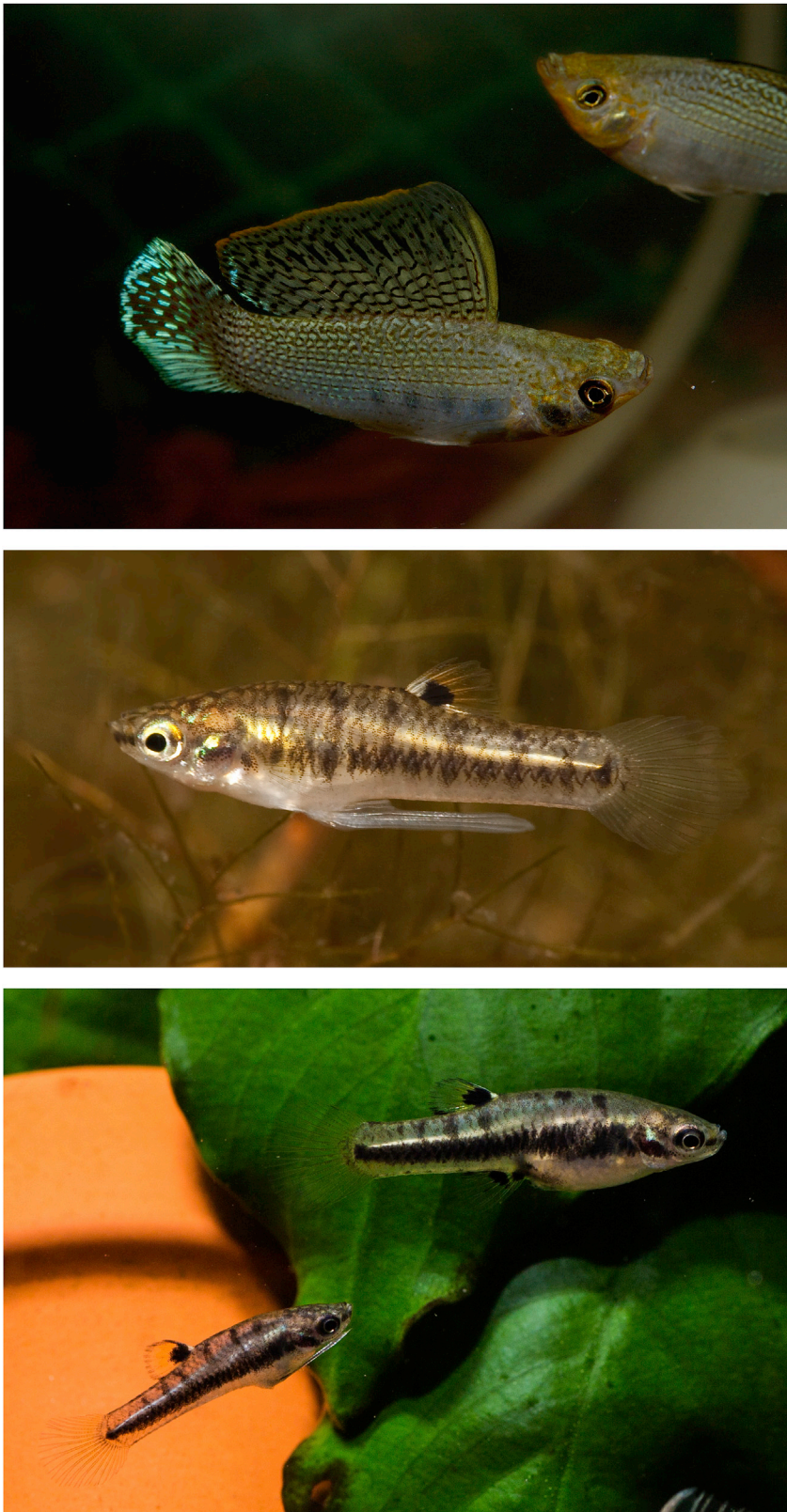
Figure 1. Maternal provisioning, courtship and coercion in poeciliid fishes.

(A) A colorful Poecilia latipinna male courts a lecithotrophic female. (B) A drab Heterandria formosa male with a long gonopodium. (C) A male with gonopodium swung forward approaches a matrotrophic Heterandria female.